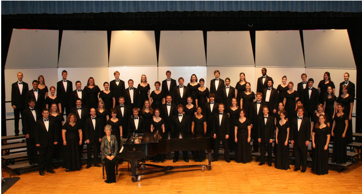
The Mansfield University Concert Choir won gold medals at the fifth World Choir Games in Graz, Austria