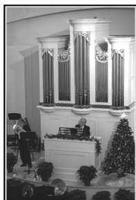
Old Salem Museums and Gardens

Wednesday, June 10 - Friday, June 12, 2009